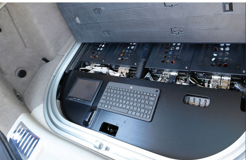
Some of the computer equipment that is used for autonomous operation is seen in a storage area in this Cadillac SRX that was modified by Carnegie Mellon University.

Because of these challenges, the first commercially available autonomous vehicles may use a “shared driving” concept of operation: that is, vehicles will drive themselves in certain conditions—such as below a particular speed, on certain kinds of roads, and in certain weather conditions—and drivers will take over outside those boundaries. But this operational concept is not without its own risks. The main challenge is how to quickly and safely reengage the human driver, who may be distracted—watching a movie, checking email, or even asleep.